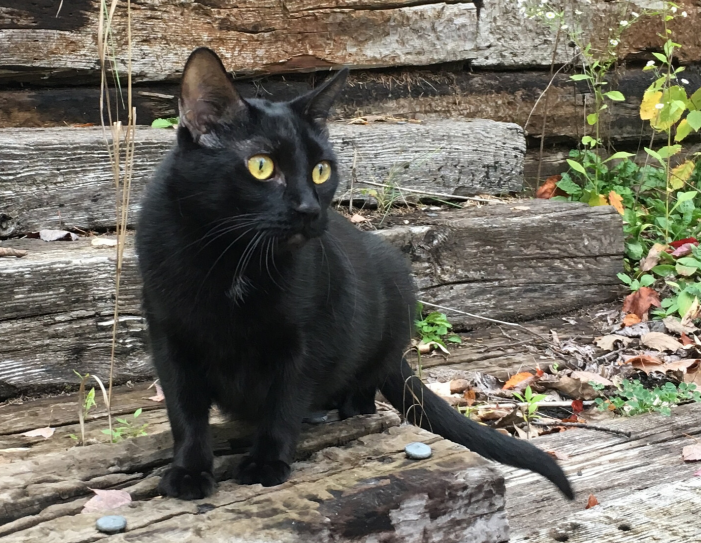
Mays, Surviving FIP on PI